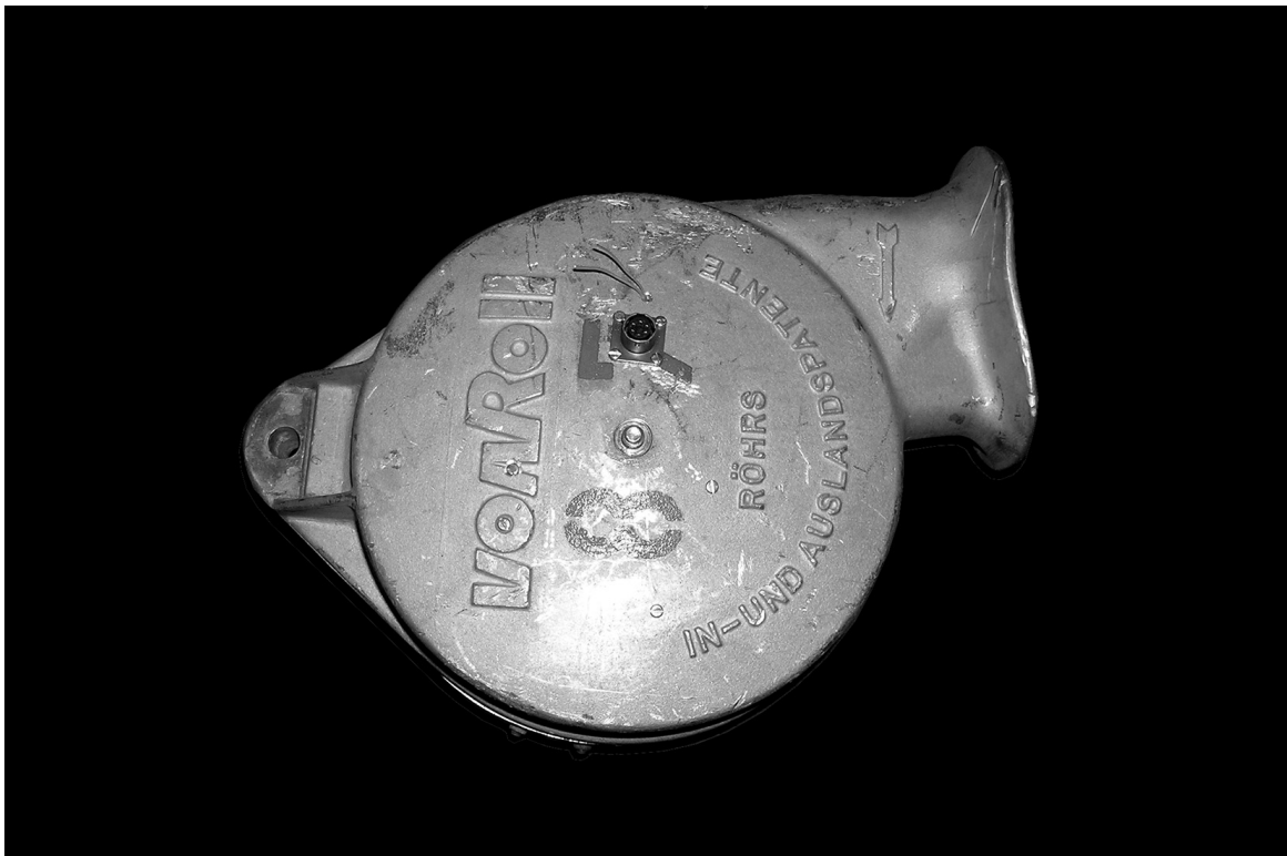
performance and sound installation / 2006