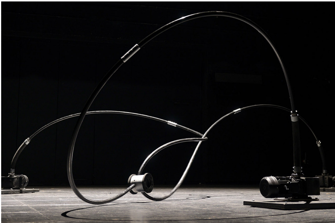
performative installation / 2013

Nyloid is an impressive sound sculpture, a huge tripod consisting of 3 nylon limbs of 6 meters in length animated by a sophisticated mechanical and sound devices. Sensual, animal and threatening, this mobile draws its dramatic power from the reactivity of its plastic and sound material to diverse mechanical constraints. Similar to a living object, its tension, effort and suffering, which result from its contortions and its vocal manifestation, can be sensed.