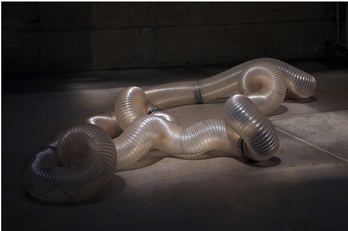
sound installation / 2017

\pi Ton/2 is a sound installation that intervenes in the continuity of the researches of Cod.Act on mechanical and sound organicity. It results from an experience on the deformation of an elastic form and its incidence on the evolution of a musical work.